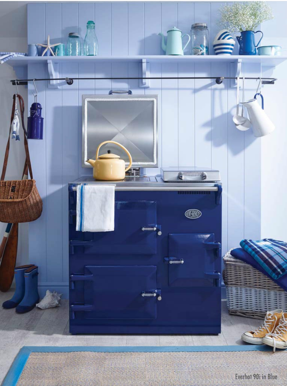
Everhot 90i in Blue